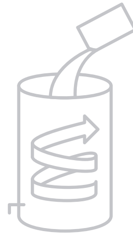
Pour WildBrew™ Sour Pitch into unhopped wort

It is recommended to use the entire sachet of WildBrew™ Sour Pitch after opening.